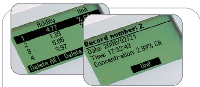
Log and Recall Data Measurements along with time and date can be stored and recalled at a later date.

The HI 84432 can also display when pump and electrode calibration was last performed.